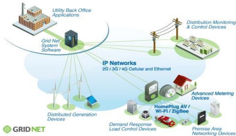
Figure 3: 5G network model [3]

[9]. Combining the current latest research models and the new technologies will give better outputs and other results. With this current network model, the operating speeds of the network will be increased a lot. By the utilization of these networks, the utilization of current trends and current technologies will increase the usage of the Internet of Things and other technologies. The infrastructure for these networks also has to be established and forgetting the better results and these networks should be installed and established in a more significant way [10][10].