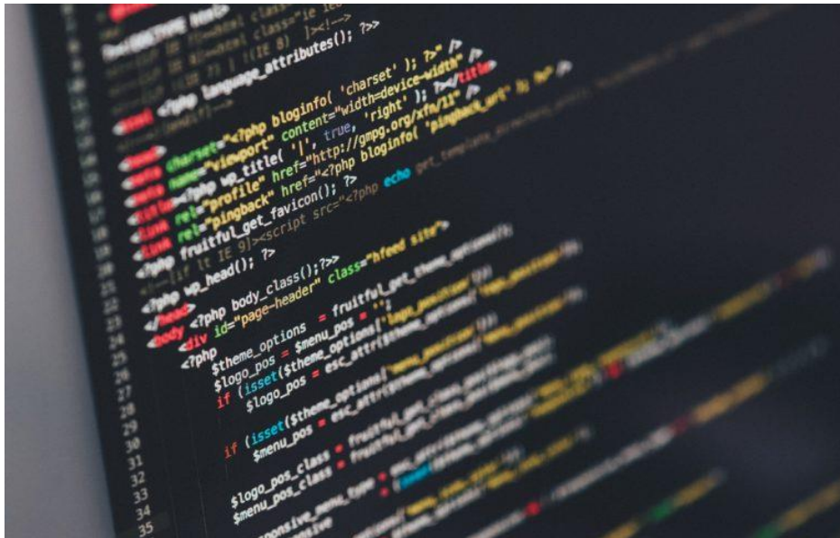
Figure 5: Blockchain model example [14]

The method of the process of blockchain is explained in detail in simple terms as a series of data that is being moved to the process of computers that can be managed by a group of computers and those computers which cannot be owned by any single authority or any company or a firm. The data can be sent in the form of a block, and the data embedded in such block cannot be accessed by any other persons as they are encrypted with some principles of encryption. The main advantage of this model or this method was the network of this blockchain has no central authority [13][14]. The primary unit that can be controlled by this unit was not at a single point. The data can be shared with handy units and the data can be used and useful for every person in the network with proper login credential data.