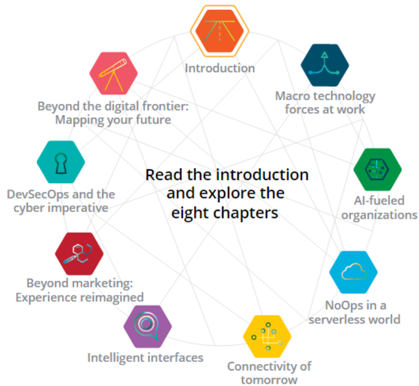
Figure 2: A cyclic model of the latest technologies

In the current section, a detailed analysis of the list of various technologies that were gaining critical day to day and their importance had increased a lot [7][8]. Some of those technologies which were making an impact on the business and other issues in the market today are discussed in detail in the section.